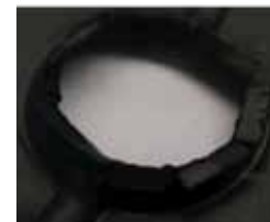
Competitive dimple sheets. Independently Tested.